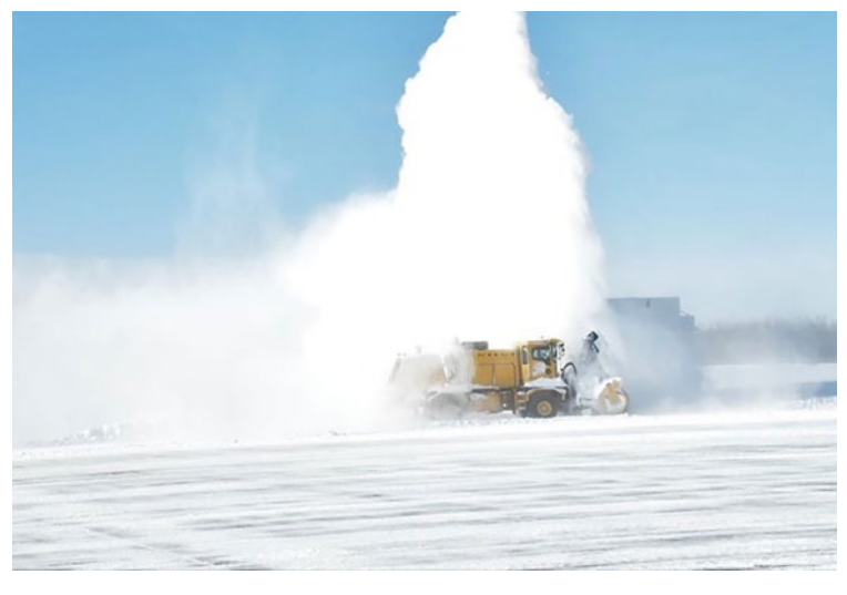
Heavy equipment operators assigned to the 148th Fighter Wing remove snow from the flight line after a two-day storm that dropped 22 inches of fresh power in the area. December 2, 2019.