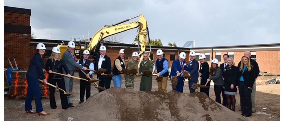
Increasing the ability to educate students in the northland, elected officials, military leaders, and community partners participate in a groundbreaking ceremony for the classroom expansion of STARBASE at the 148th Fighter Wing in Duluth on November 6, 2019.