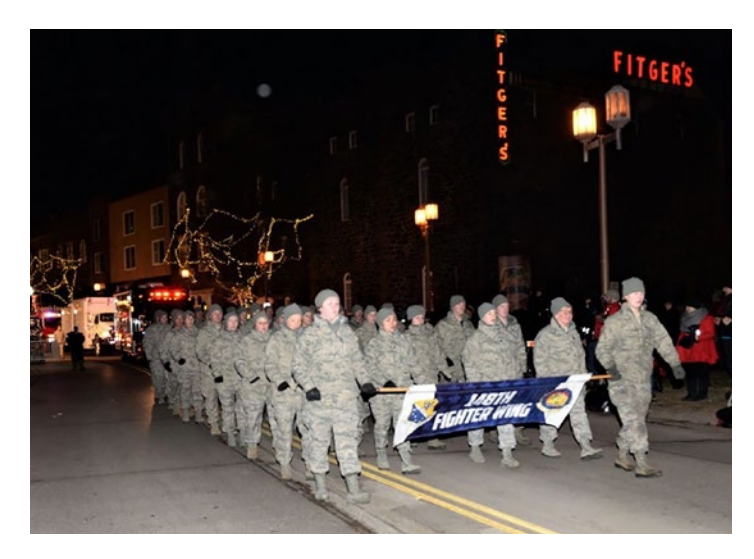
Continuing a longstanding tradition, members of the 148th Fighter Wing assemble to march in the Christmas City of the North Parade in downtown Duluth in November 2019.