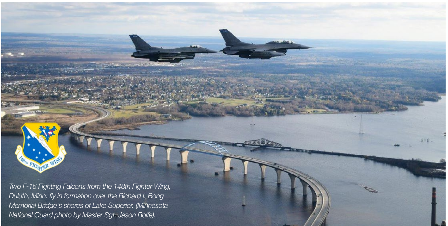
Two F-16 Fighting Falcons from the 148th Fighter Wing, Duluth, Minn. fly in formation over the Richard I. Bong Memorial Bridge's shores of Lake Superior.