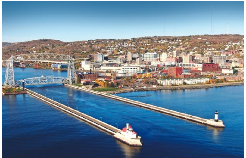
A panoramic view of the historic Duluth Aerial Lift Bridge and city of Duluth, Minn..