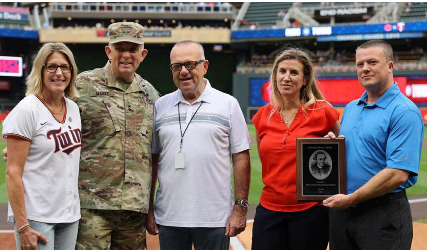
MN Twins receive the NGAUS' Patrick Henry Award at the MN Twins Armed Forces Appreciation Day game.